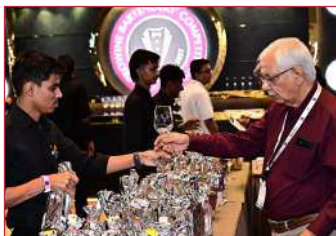
ProWine Spirits Challenge