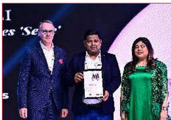
Industry Awards & Felicitation