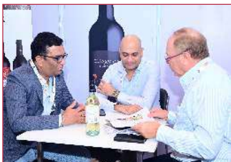
B2B Networking Evening