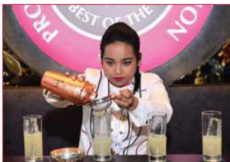
ProWine Bartenders' Competition