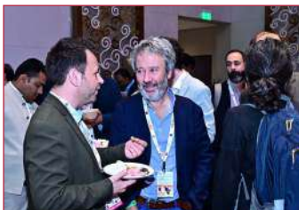
ProWine Mumbai Night